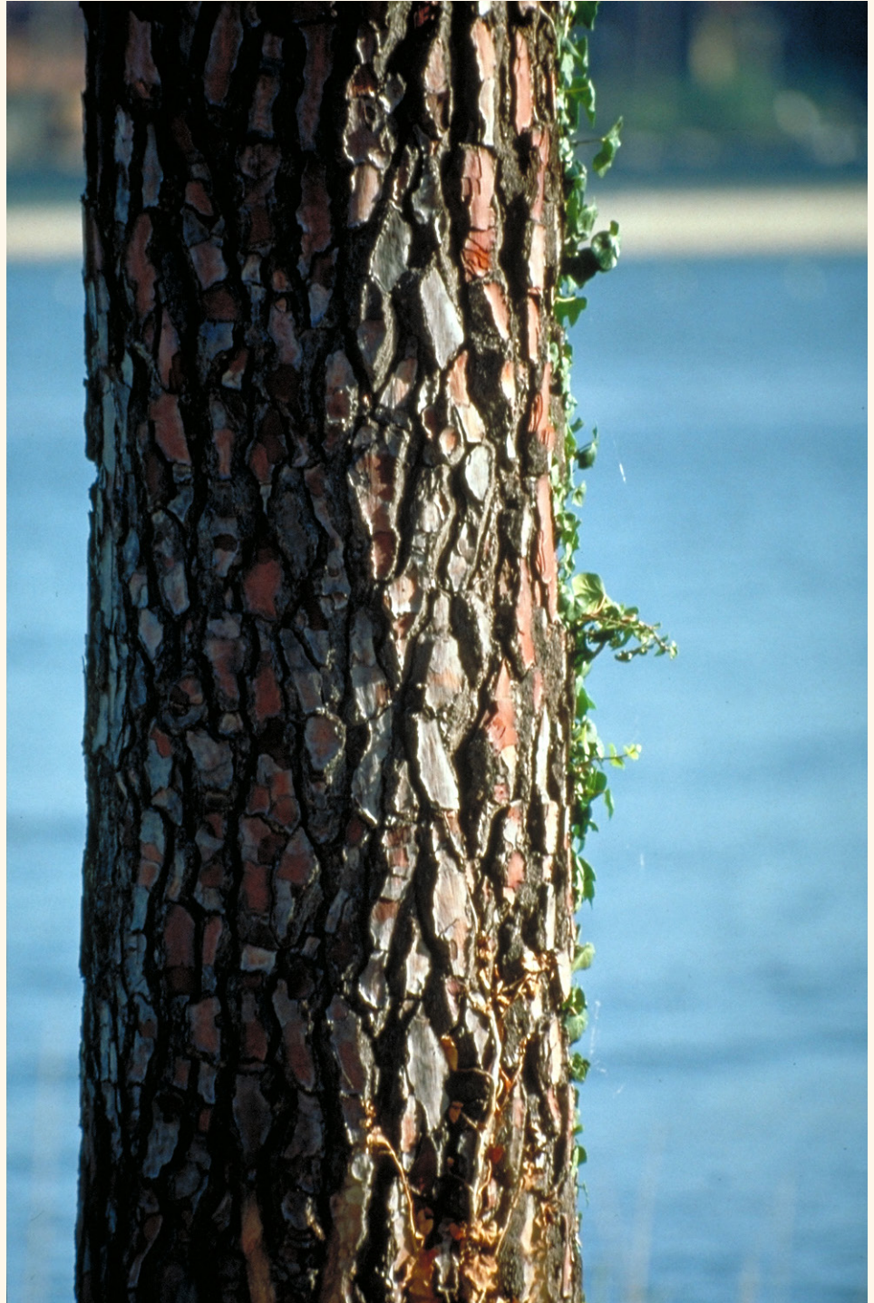
Pinus pinaster .